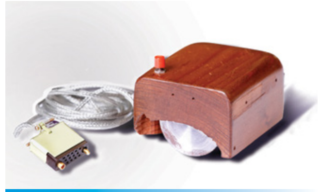
Figure 1 - Engelbart computer mouse prototype (1968) [25]

Throughout recent years, advances in VR and AR technology catalyzed the emergence of a series of devices based on new acquisition paradigms, including computer vision, electromyography and gyroscopes. To address previously identified problems, project InMERSE explored the fusion and contextualization of interaction in immersive environments: fine gestures using Myo and LeapMotion devices with greater precision ( Figure 2 ), complementing Kinect motion capture, plus context synchronization between immersive display devices, namely (by then state of the art) Oculus Rift and Google Glass. Furthermore, to achieve the technological objectives of the project, a multi-device framework was created allowing to abstract motion recognition and its application semantics, thus also mitigating technological obsolescence in an area where devices are coming and going at a fast pace. The software library for natural interaction was made available in open-source [21] and allowed the development of two demonstrators: a digital signage prototype and an interactive, immersive multi-user installation [22]. Although being a big advance relatively to most of the limitations found in previous projects, this approach is not yet a solution for widespread use cases because of the complexity and cost of the required mix of the devices.