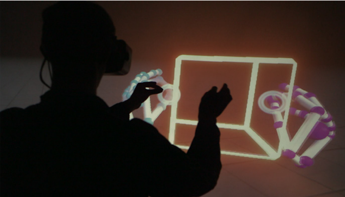
Figure 2 - LeapMotion tracking hands VR demo [26]

More recently, a small revolution has been happening in the software side, with the introduction of new toolkits for gestures recognition based on state of the art machine learning/deep learning techniques. ARaNI project explored these emerging technologies in AR/MR scenarios.